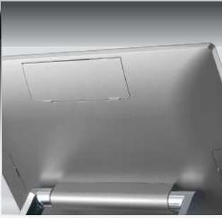
LCM/ 2nd Display

2nd Display Available in 8" and 10" can be extended as standalone, and 15" and 15.6 for docking only