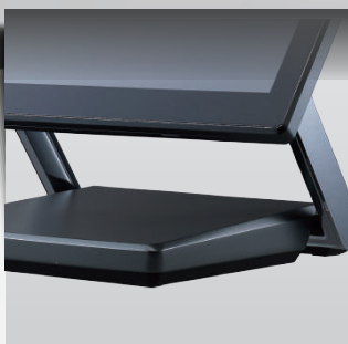
Xtation (I/O Box)