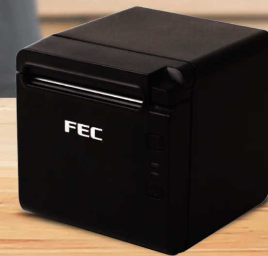
TP-100 XP-3685 with wallmount