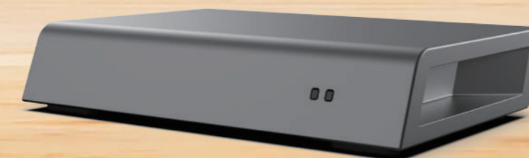
*XT-100 with basic I/O also provides USB DP wired connection