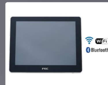
Built-in Wi-Fi and Bluetooth.