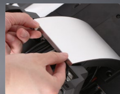
Efficient cable management in dual-hinge stand.