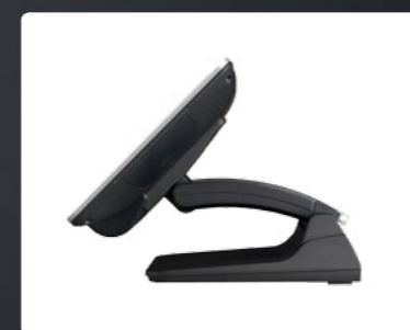
Tiny foot print, ultra slim profile, foldable dual-hinge stand for outstanding space saving.