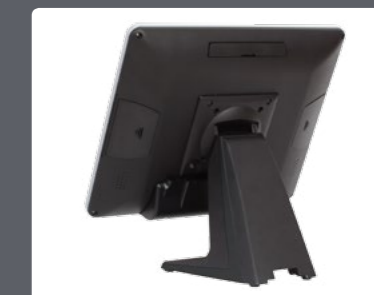
Standard base optional