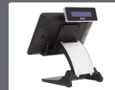
Integrated Customer Display