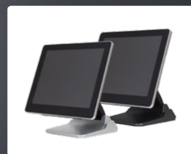
Dual-hinge stand in black and silver color.