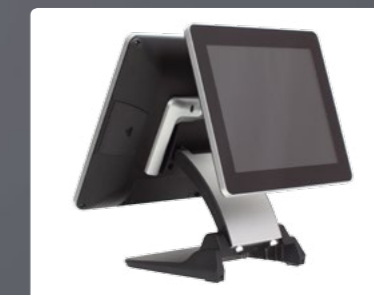
Integrated AerArm 12inch Display