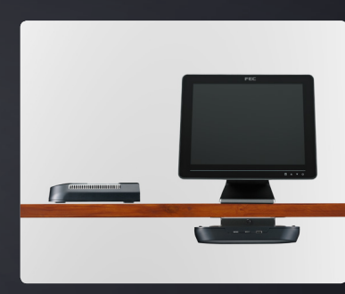
BP-864 can be easily mounted onto any flat surface.