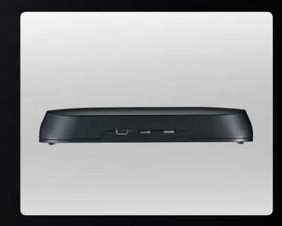
It is extremely compact measuring at 29 centimeters in width, 4.3 centimeters in height and 22.6 centimeters in depth.