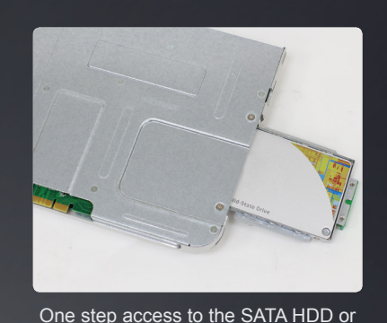
SSD for easy serviceability.