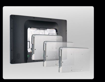
BP-864 CPU box can be integrated to various sizes of FEC Aer Panel PC.