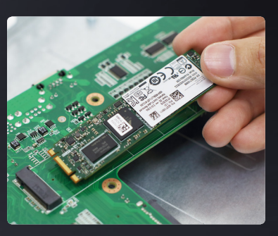
Supported M.2 socket interface.