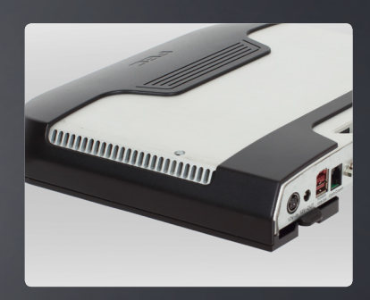
The thermal fin design on BP-864 increases heat transfer effectiveness, keeping it cool