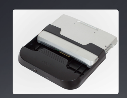
CPU box and case can be easily detached to upgrade and maintain.