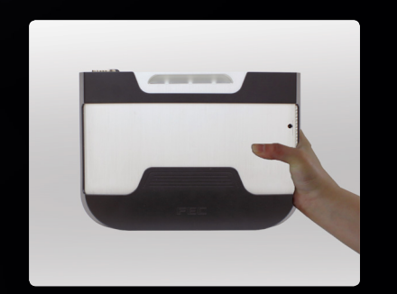
BP-864 weighs only 2.8 kilograms