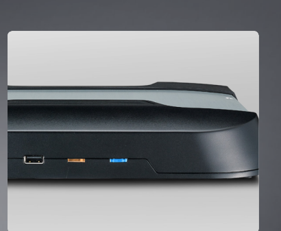
Power button, hard disk indicator and USB port is located in the front face for quick maintenance.